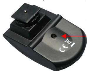
Screw for opening the housing