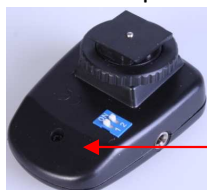
Screw for opening the housing